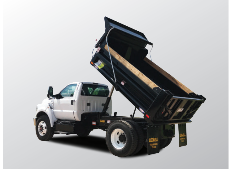
Ledwell 5-6 yard Box Dump