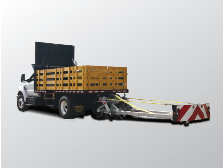
Ledwell Attenuator Truck

During the 2017 season of the Texas State Fair, Ledwell had the honor to feature two custom built units in Ford's designated area including our Ledwell 5-6 yard box dump featured on a F650 and Ledwell's newest addition to our product line, the Attenuator Truck. The show-cased Ledwell Crash Truck incorporated a 16 foot bed with removable stake sides and Trinity attenuator.