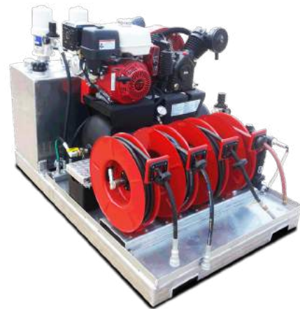
LUBE BUDDY JR.