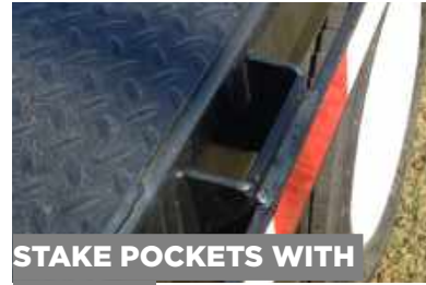
STAKE POCKETS WITH RUB RAIL

Choose from a variety of add-ons to get the custom equipment you need.