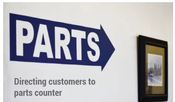
Directing customers to parts counter