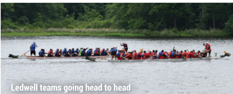
Ledwell teams going head to head

To find out more about the race, visit Texarkana Dragon Boat Festival website or follow the event on Facebook. You can also use these resources to check out pictures and videos of the event!