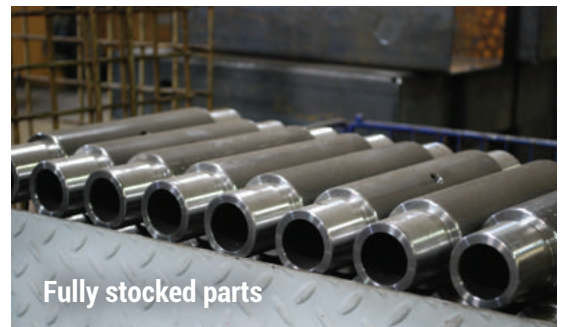
Fully stocked parts