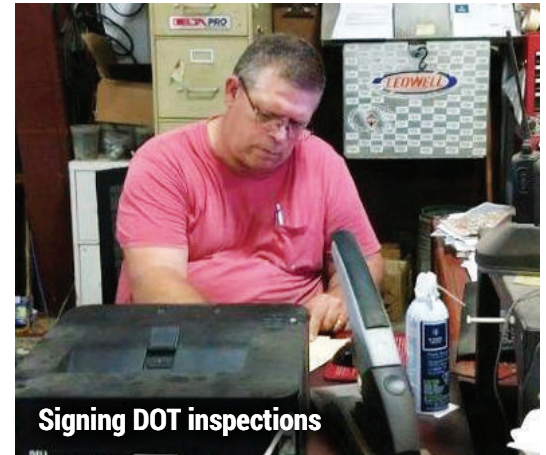
Signing DOT inspections