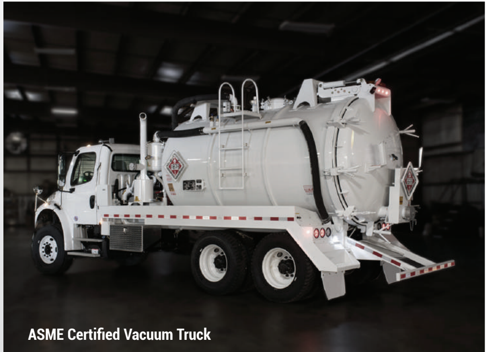
ASME Certified Vacuum Truck