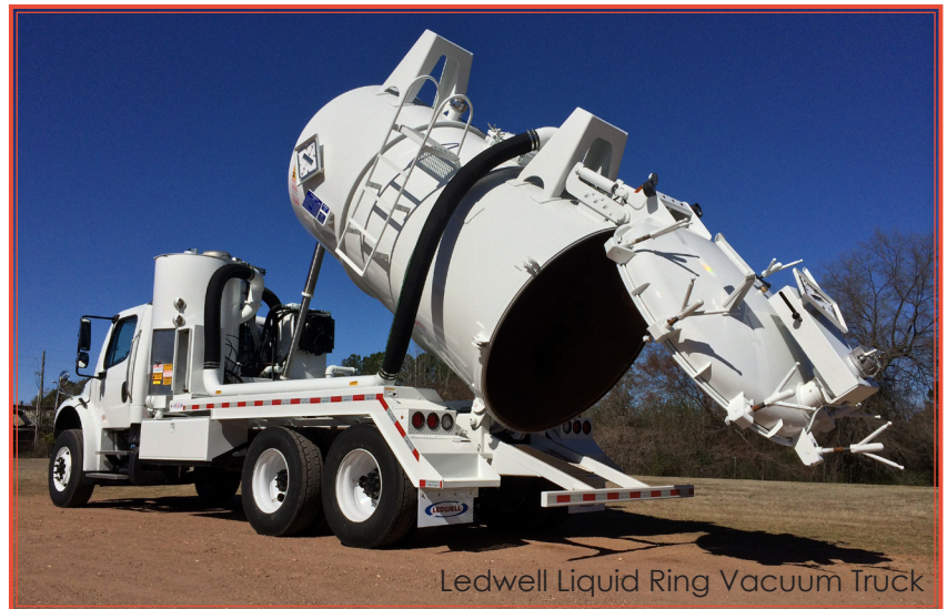
Ledwell Liquid Ring Vacuum Truck

We're thankful at Ledwell that we found our pump manufacturer and that our customers can continue to depend on the quality products we build, regardless of where we have to go to find the parts and pieces.