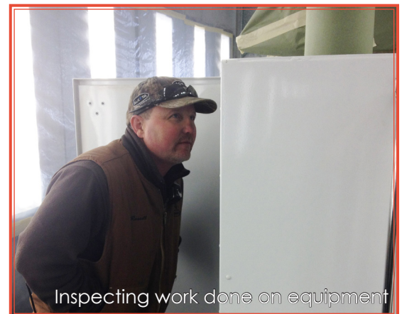
Inspecting work done on equipment

Visit www.ledwell.com/employee-spotlights to see more Employee Spotlights throughout the year.