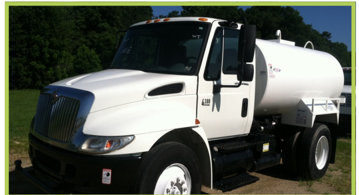
2009 IHC 4300 + NEW Ledwell 2000WT