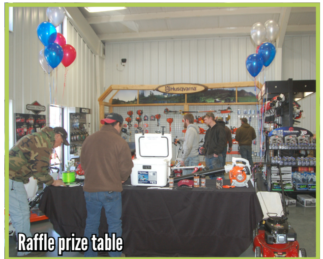
Raffle prize table