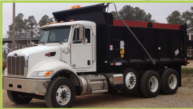
2012 Peterbilt 348 + Ledwell 16yd Box Dump