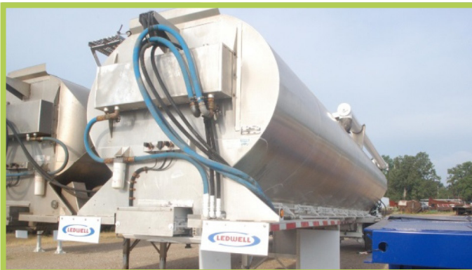
2007 Ledwell 40' Aluminum Drag Chain Trailer