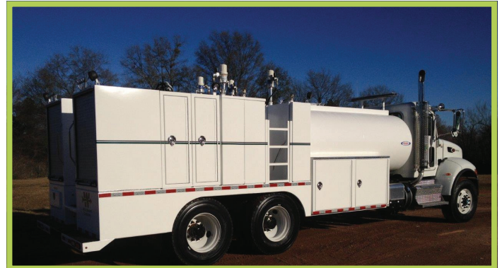
2012 Ledwell Fuel and Lube Body Only