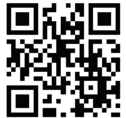
Scan with your smartphone to view the Building Dedication video.