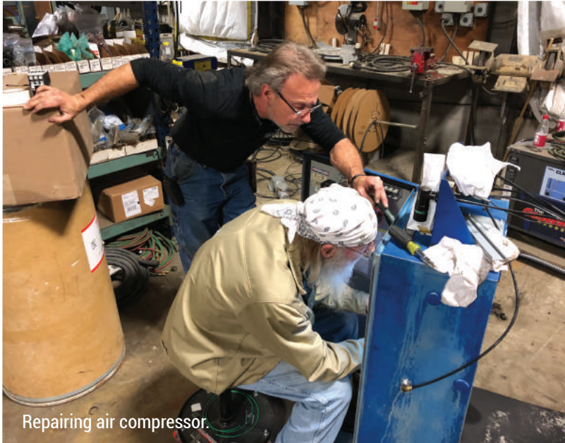
Repairing air compressor.