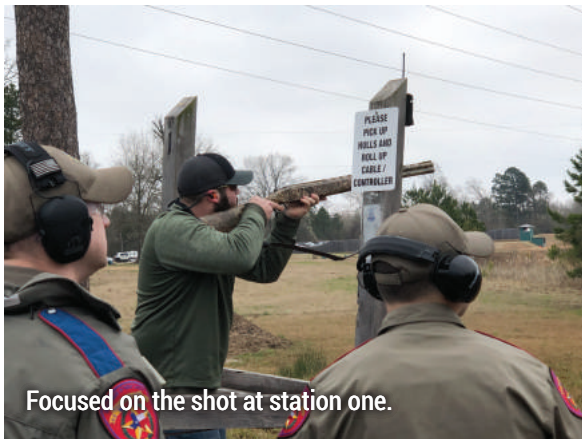
Focused on the shot at station one.