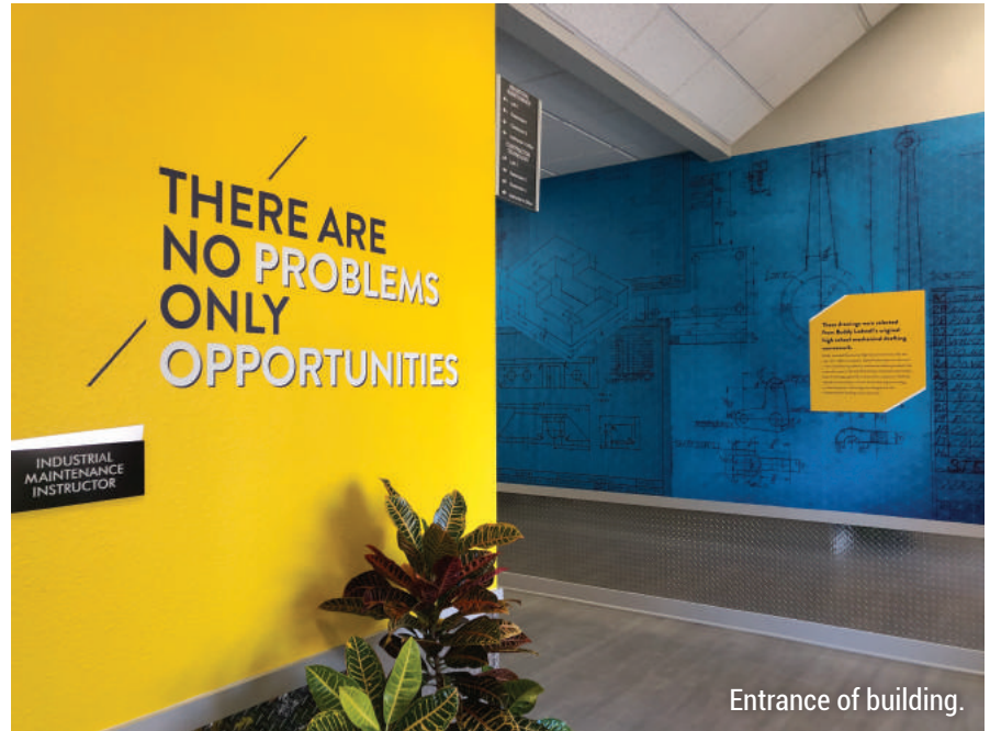
Entrance of building.

According to TC, the program currently has more than 670 workforce students – near 100 of them enrolled in Industrial Maintenance or Construction Technology. They are expecting growth in program participation, especially since their classes are held during the day and evenings to provide an opportunity for schooling in any situation. The goal is to promote enthusiasm and prosperity for this type of skill.