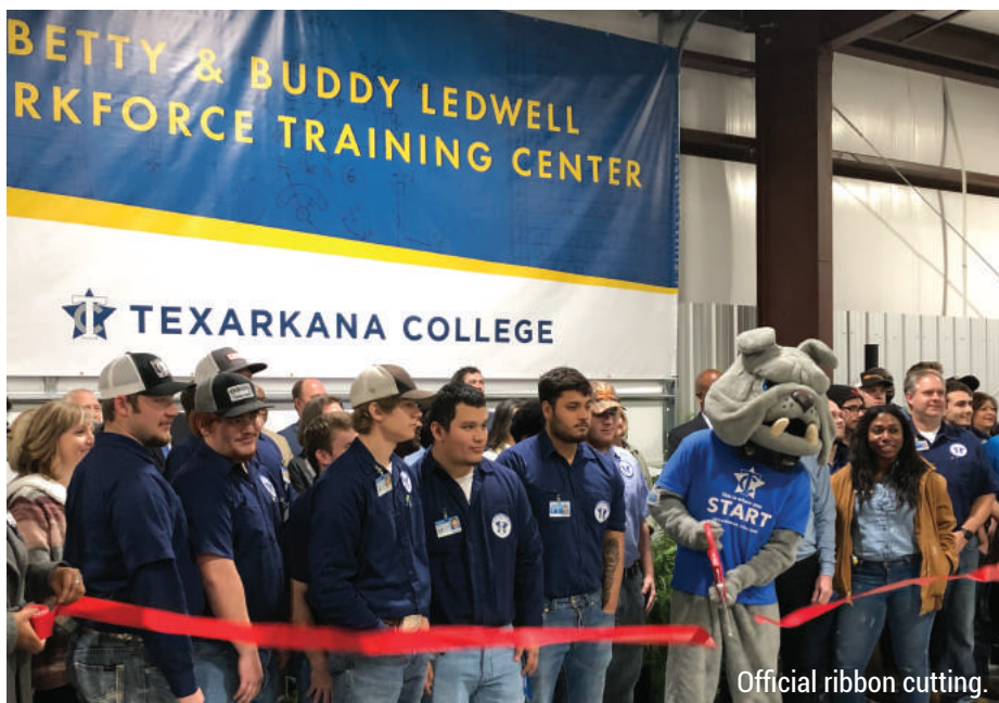
Official ribbon cutting.