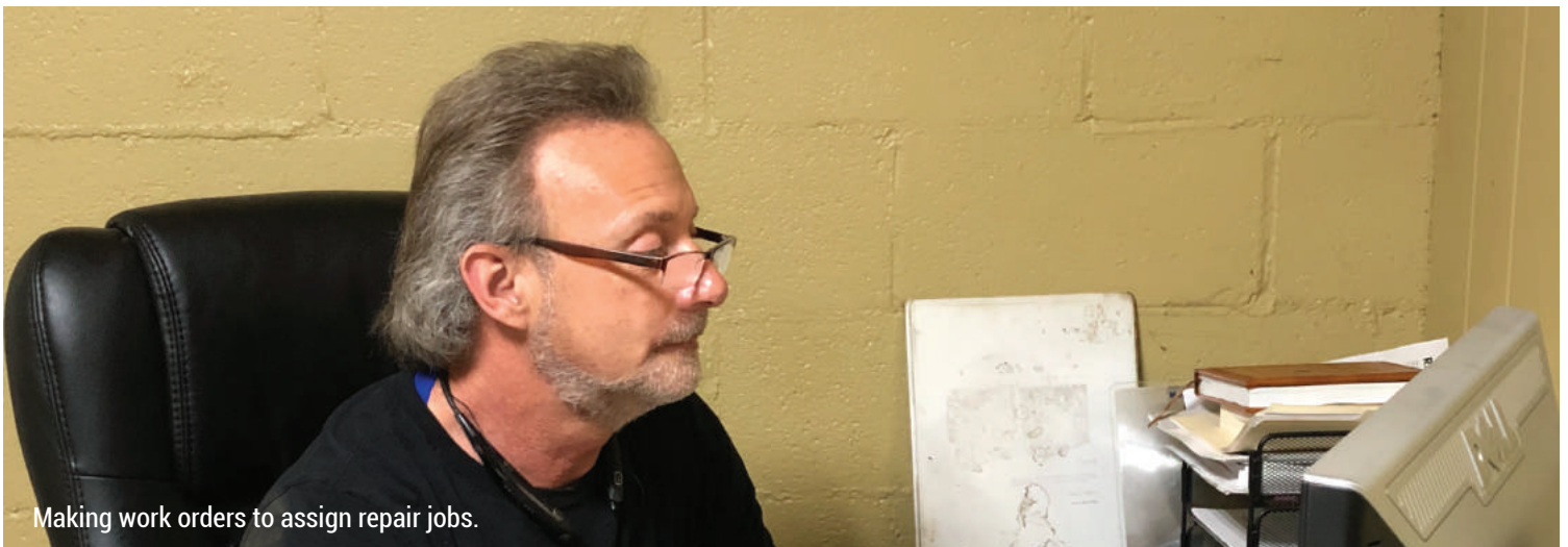
Making work orders to assign repair jobs.