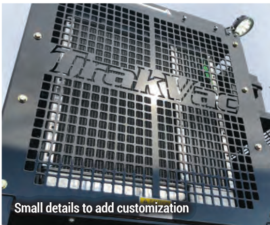
Small details to add customization

Its specific purpose is to get a compact Hydro Excavation unit anywhere you need it to be - places where a normal wheeled truck can't even begin to reach. This vacuum unit functions similarly to our Blower Vacuum Truck. It's equipped with a high pressure water system and 1600cfm vacuum blower. With a GVWR of 55,000 pounds, the TrakVac on the Prinoth Panther T12 has a ground pressure of approximately six pounds per square inch.