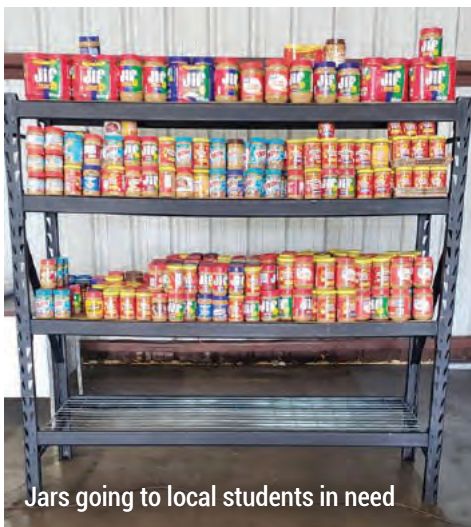
Jars going to local students in need