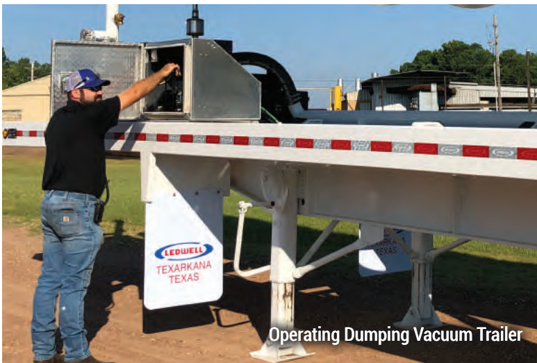
Operating Dumping Vacuum Trailer