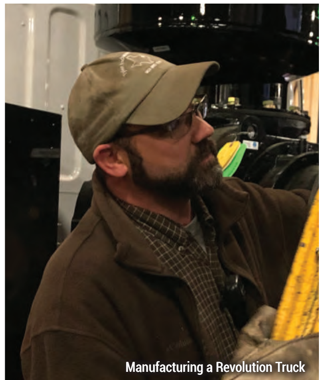
Manufacturing a Revolution Truck

Ledwell's Truck shop puts the pieces of your puzzle together, taking us one step closer to a finished product. Our craftsmen mount truck bodies to their frames and test every piece that passes through our Ledwell line.