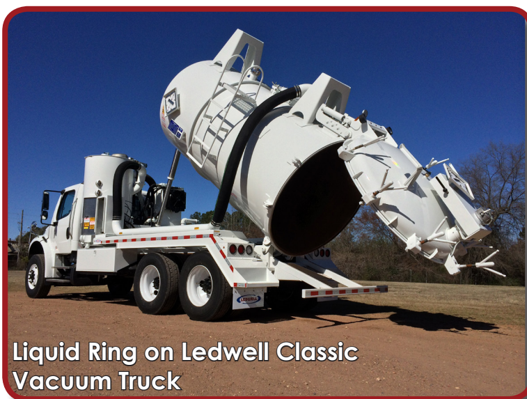
Liquid Ring on Ledwell Classic Vacuum Truck

A unique feature, relative to the liquid ring, is the ability to capture Hydrocarbons extracted from hazardous materials that are being pumped into the vacuum tank. Water containment is employed to capture the hydrocarbon in the water to be pumped into another on-site container. The liquid ring is recommended by the American Petroleum institute as the pump of choice to be employed in or around hazardous material.