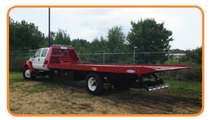
2011 Ledwell 26' Hybrid Rollback