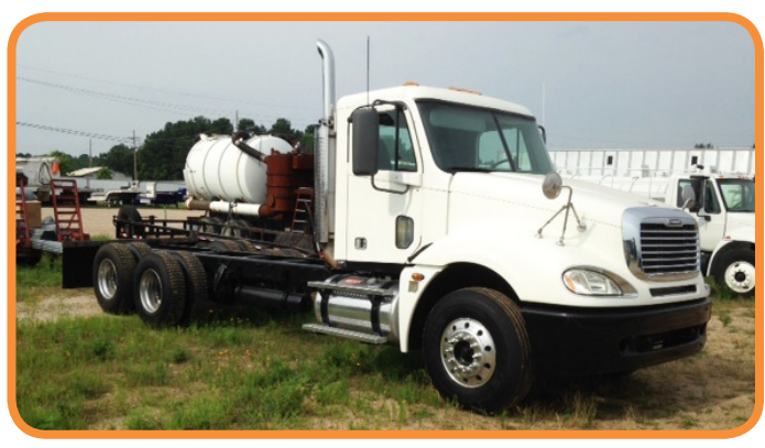
2006 Freightliner Columbia