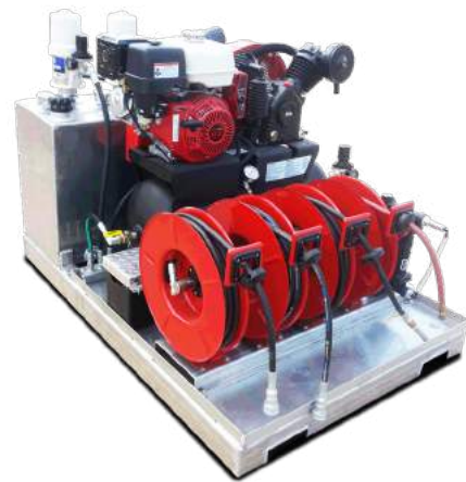
LUBE BUDDY JR.