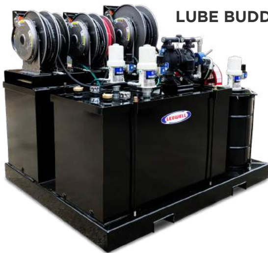
LUBE BUDDY MAX

Available with two 20-gallon fresh tanks and one 40-gallon waste tank or 100 and 50 gallon fresh tanks and 150-gallon waste tank, respectively. The Lube Buddy is a must-have for any operation to service equipment when and where you need to.