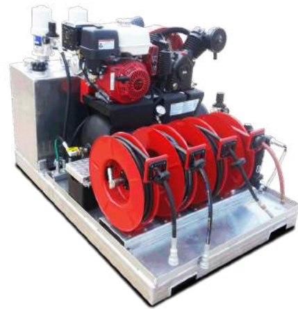
LUBE BUDDY JR.