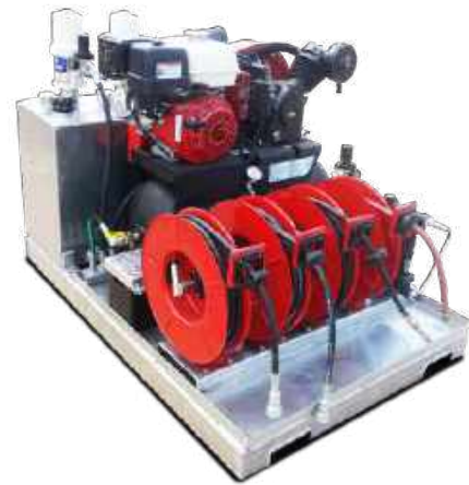
LUBE BUDDY JR.