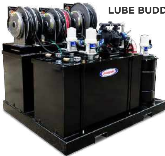
LUBE BUDDY MAX

Available with two 20-gallon fresh tanks and one 40-gallon waste tank or 100 and 50 gallon fresh tanks and 150-gallon waste tank, respectively. The Lube Buddy is a must-have for any operation to service equipment when and where you need to.